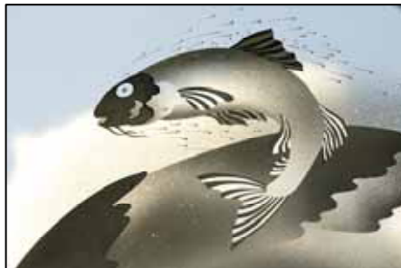
Detail from West Door

Orchestral / Choral Concert 19.30 – 21.30